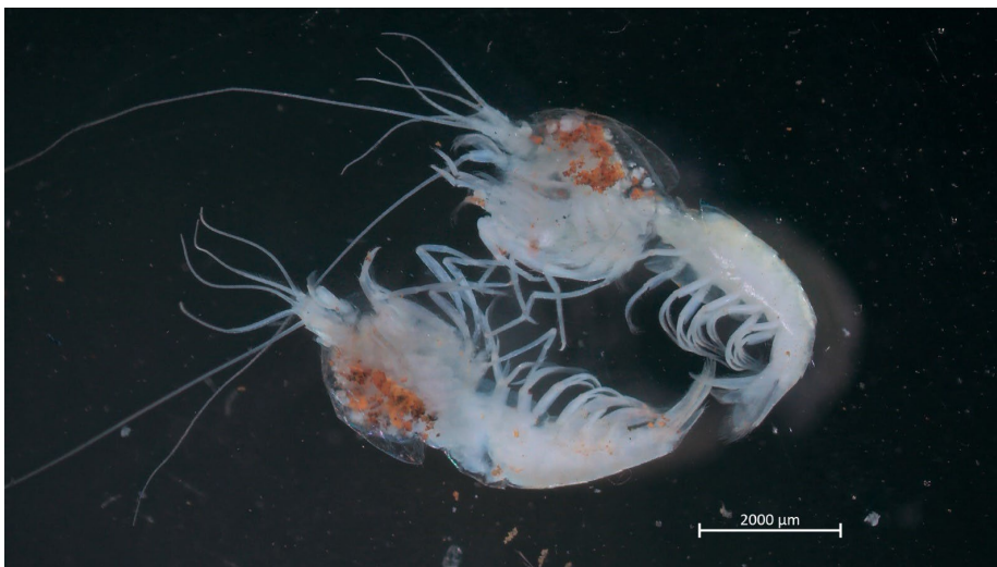
Fig 1. Shrimp collected as part of task 3

Water chemistry was determined for all bores sampled and sampling approaches, such as dissolved oxygen and salinity profiling throughout the bore were also trialled during the field trip. These data have also been used to update database details for Task 1.