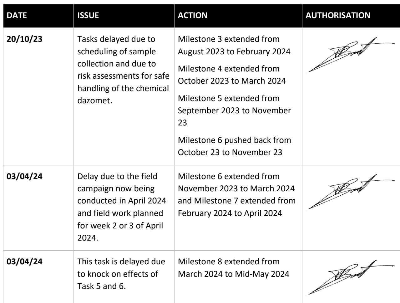
Register of changes to Research Project Order

The table below details variations to research Project Order.