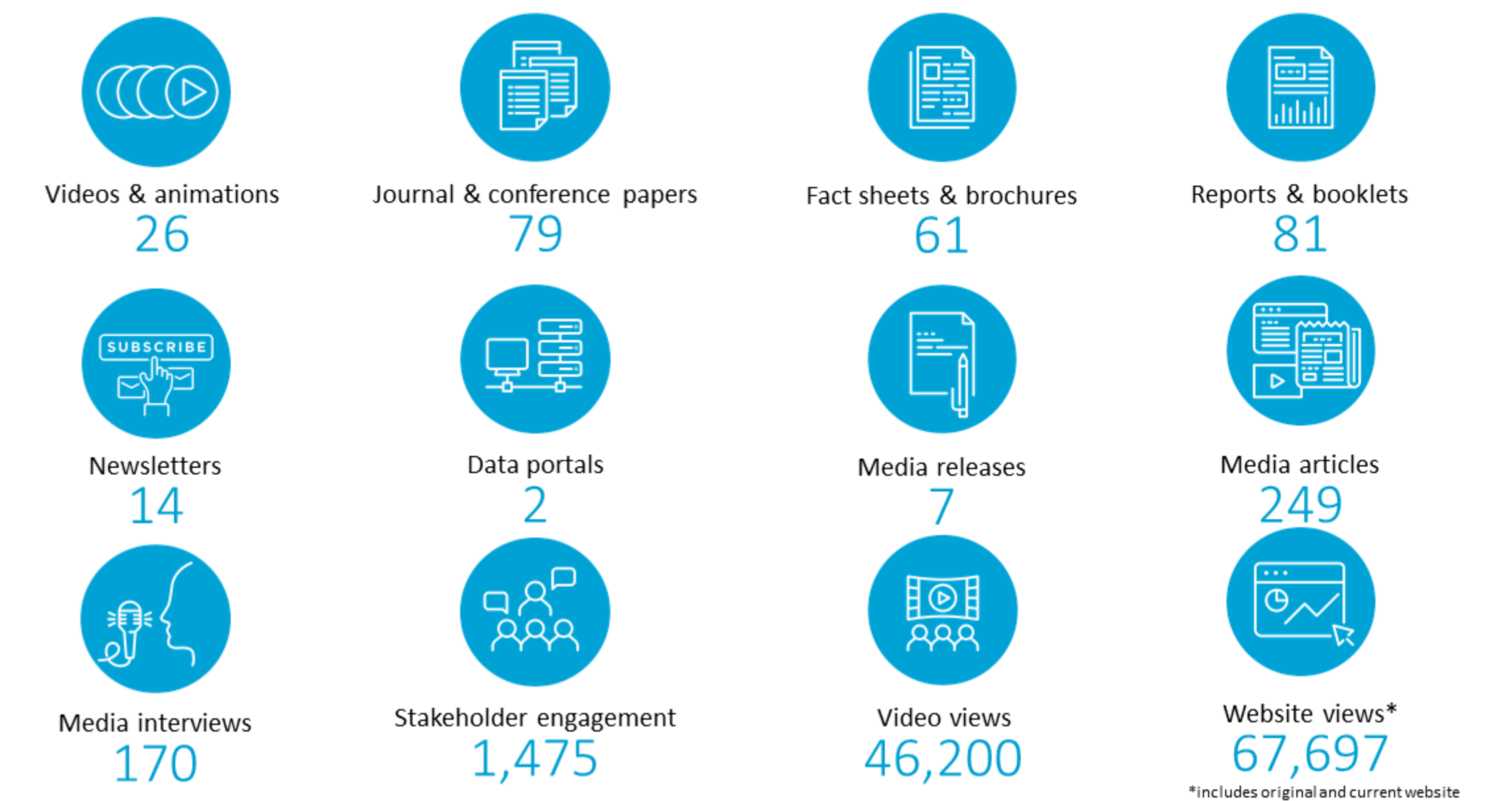
Figure 4: GISERA Project outcomes are shared widely with stakeholders, community and government.