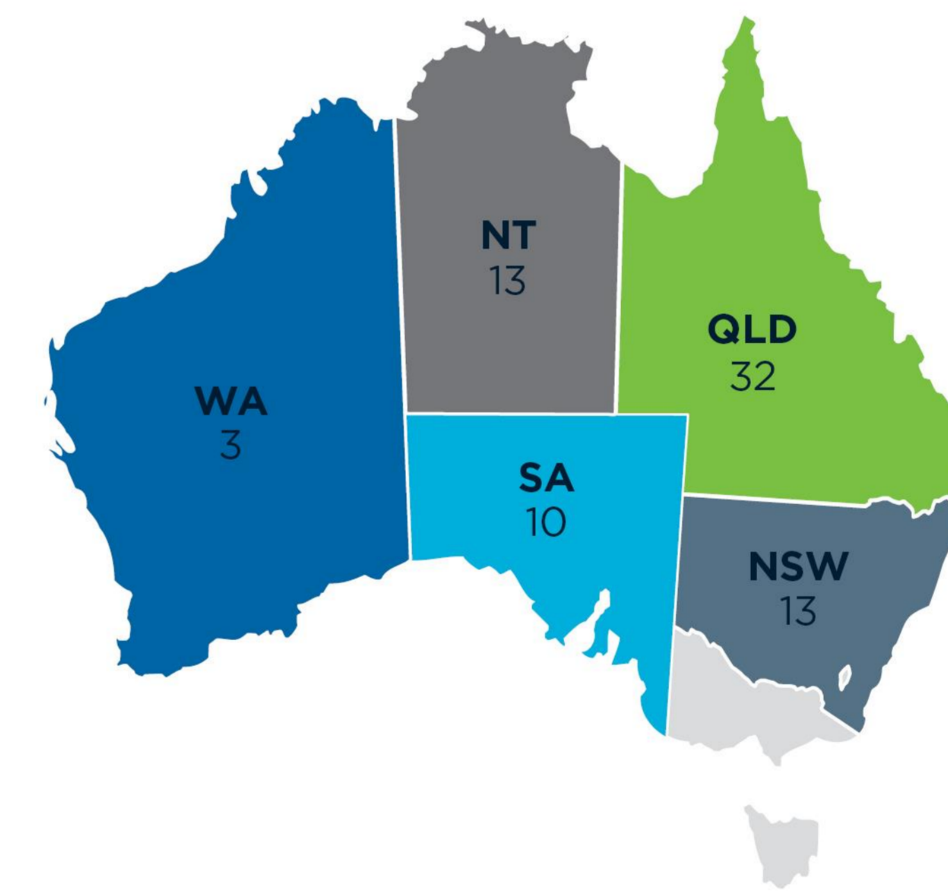
Figure 3: Number of projects conducted in each state as of August 2021