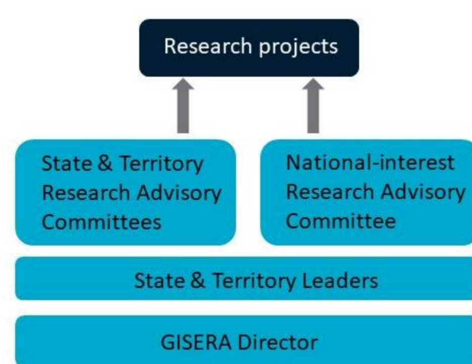
Figure 1: Governance approach to approving projects in the national interest

Companies do not have any rights to alter, edit or influence research outcomes or reports written by CSIRO under GISERA. CSIRO's researchers need to report any risk to public or environmental health and safety identified to the relevant authorities. This results in the sharing of clear, trusted information.