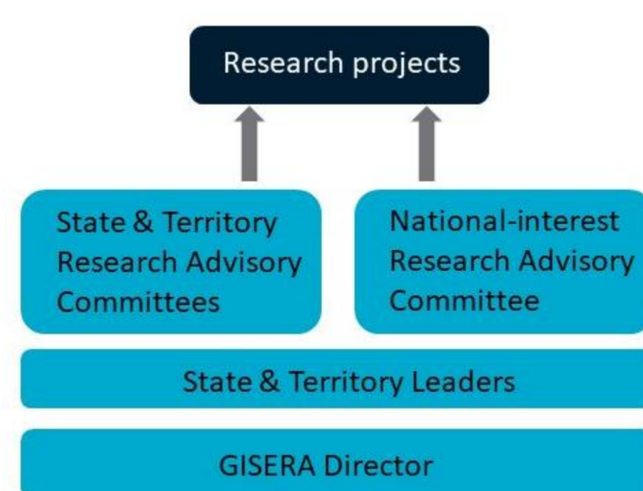
Figure 1: Governance approach to approving projects in the national interest

Companies do not have any rights to alter, edit or influence research outcomes or reports written by CSIRO under GISERA. CSIRO's researchers need to report any risk to public or environmental health and safety identified to the relevant authorities. This results in the sharing of clear, trusted information.