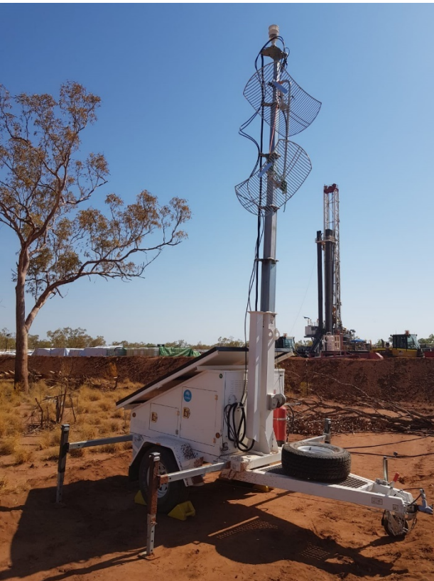
Figure 1: An autonomous emission monitoring station (AEMS) developed by CSIRO Energy. This photograph shows a recent trial at an industry site in the Beetaloo sub-basin. A drill rig can be seen in the background.

The answers to these questions will help inform further decisions if such autonomous networks will be operationally viable options or if alternative means such as the more traditional estimations coupled with screening and validation of the estimations are sufficient.