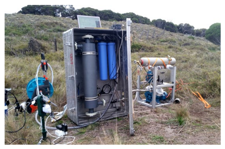
Field-going vacuum system used to collect samples.