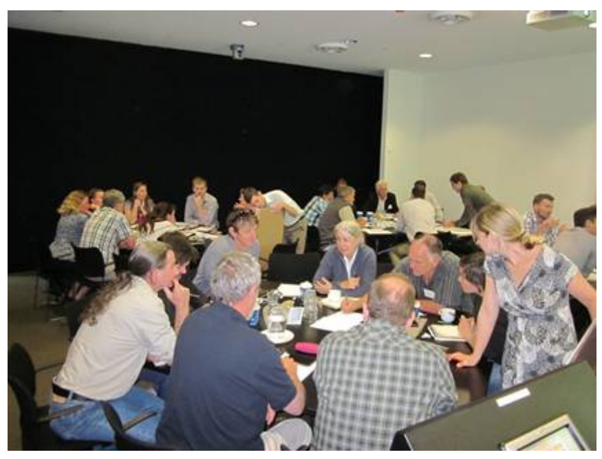
Robust discussions at the stakeholder workshop, October 2014.

persistence of biodiversity. The end result will be a cost-efficiency analysis to determine the best management strategies for a range of budgets.